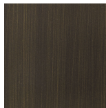
Brushed dark bronze