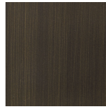
Brushed dark bronze