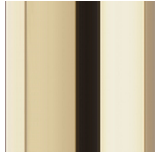
Glossy gold metal inserts