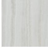
Ivory porcelain gres