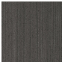
Tay veneered dyed Smokey Gray